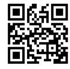
Check Out Reg Lab

We bring together peer networks for commissioners and staff that offer a winning combination of expert insights and a safe space to collaborate with other commissions.