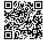
Financial Modeling with Optimus

We bring together peer networks for commissioners and staff that offer a winning combination of expert insights and a safe space to collaborate with other commissions.