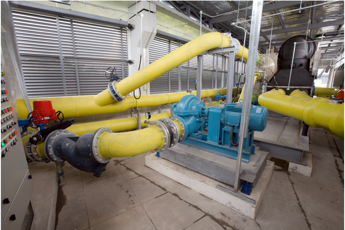
Fig. 2: A 2009 Singapore piping system by LEE Eng Lock, saving ~69% of normal pumping energy with reduced capex (partly because of the smaller pumps and motors).

These pumping examples hold another key lesson (Fig. 3 on next page): each unit of friction or flow saved in the piping system saves ~10 units of fuel, emissions, and cost at the power plant, because the ~10× compounding losses from power-plant fuel to pipe flow are turned around backwards into compounding savings. Starting savings downstream also makes the upstream components progressively smaller, simpler, and cheaper, saving the most capital cost too.